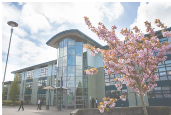
Gartree High School